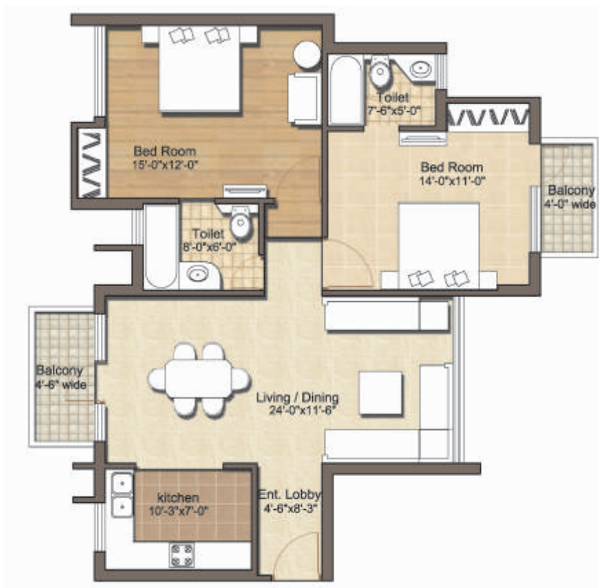
UNIT PLAN TYPE : 1330 sq. ft.