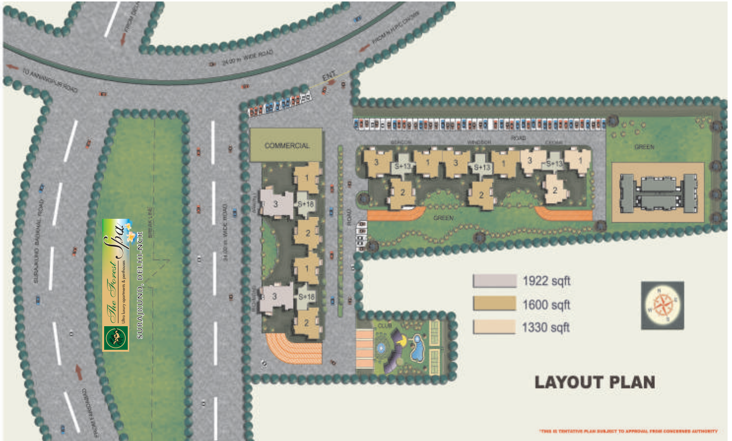
TYPICAL 2 B/R FLOOR PLAN (Saleable Area - 1330 Sq.ft.)