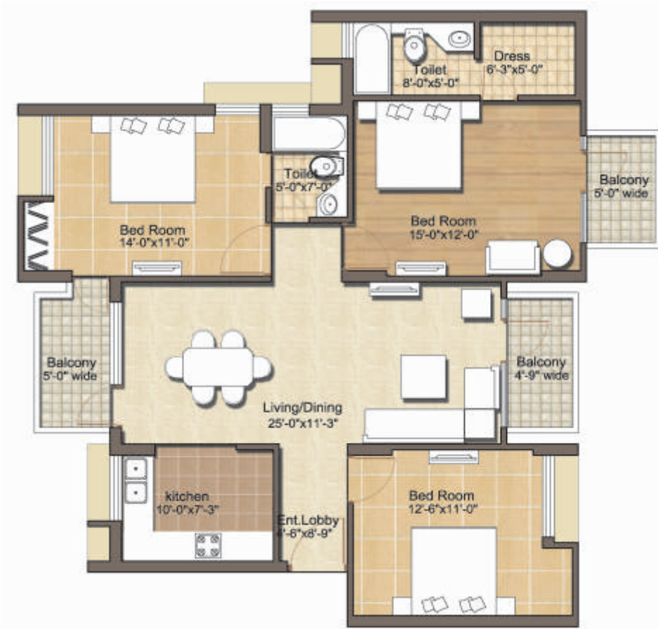
UNIT PLAN TYPE : 1600 sq. ft.

* This is tentative plan subject to approval from the concerned authority