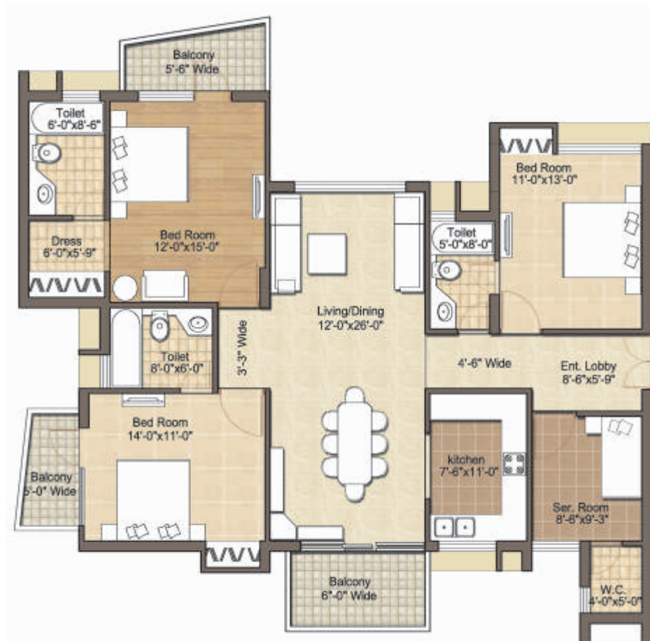
UNIT PLAN TYPE : 1922 sq. ft.

* This is tentative plan subject to approval from the concerned authority