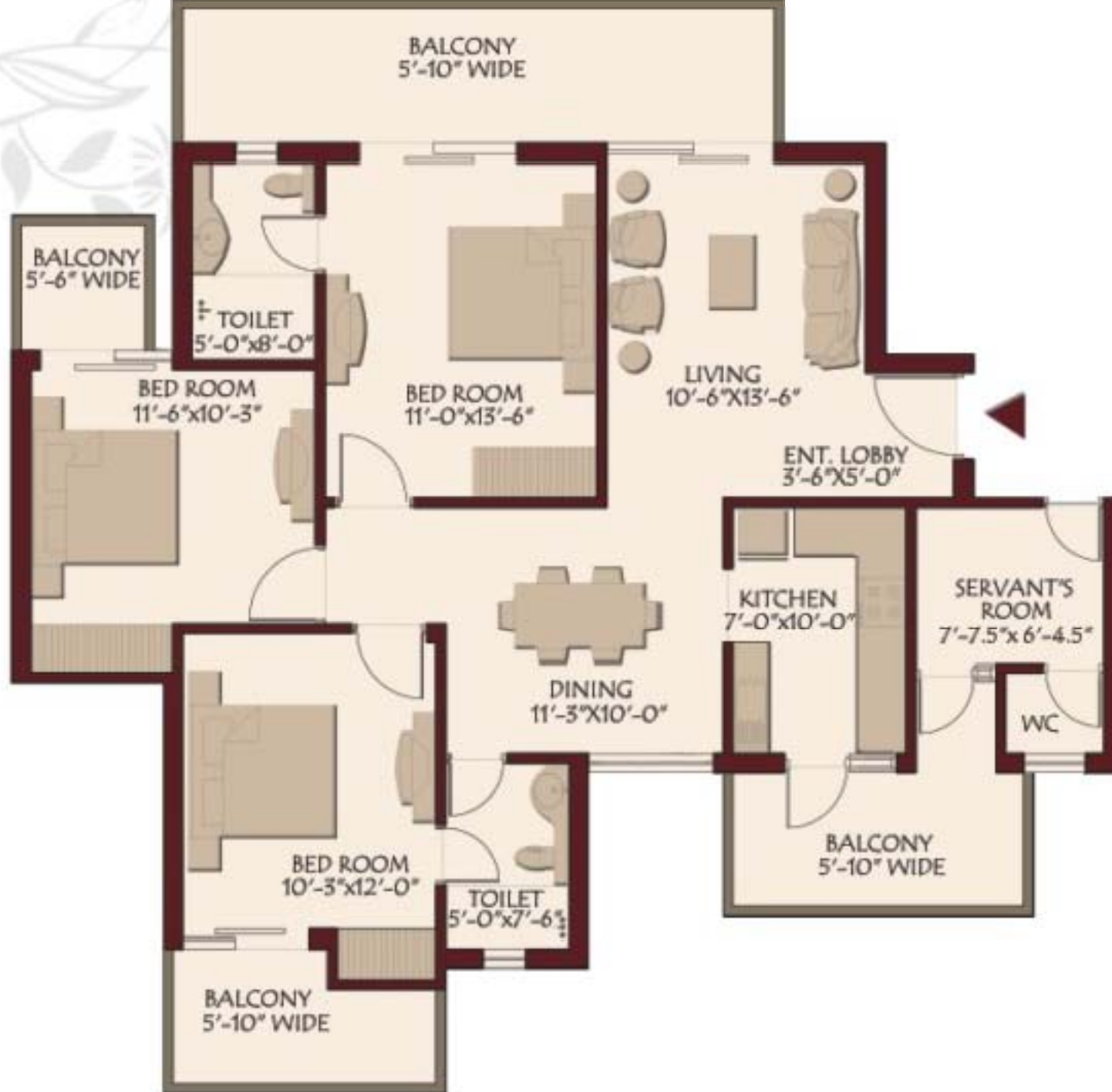
THREE BED ROOM + SERVANT UNIT