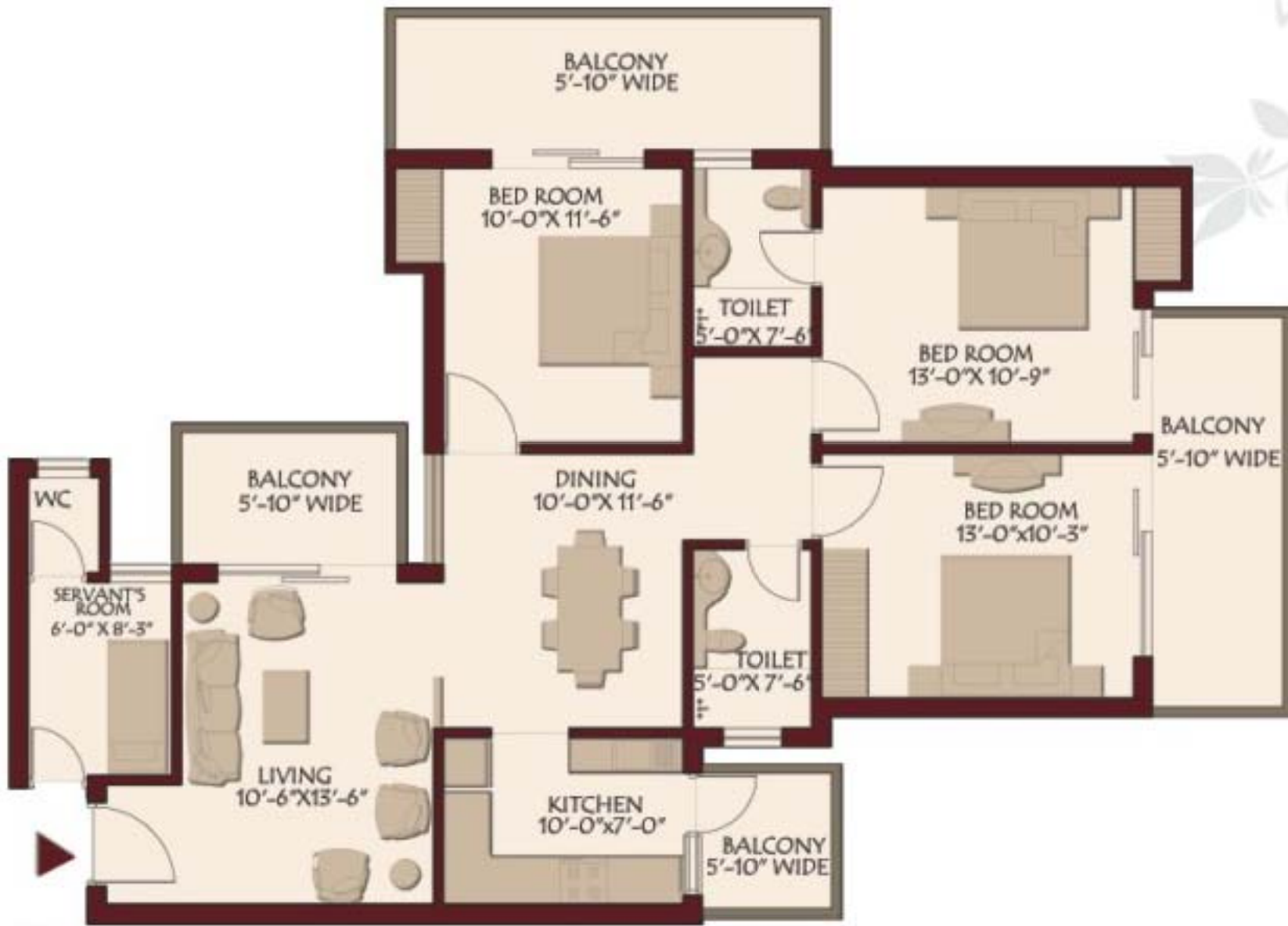
THREE BED ROOM+ SERVANT UNIT SUPER AREA : 1602 SQ.FT.