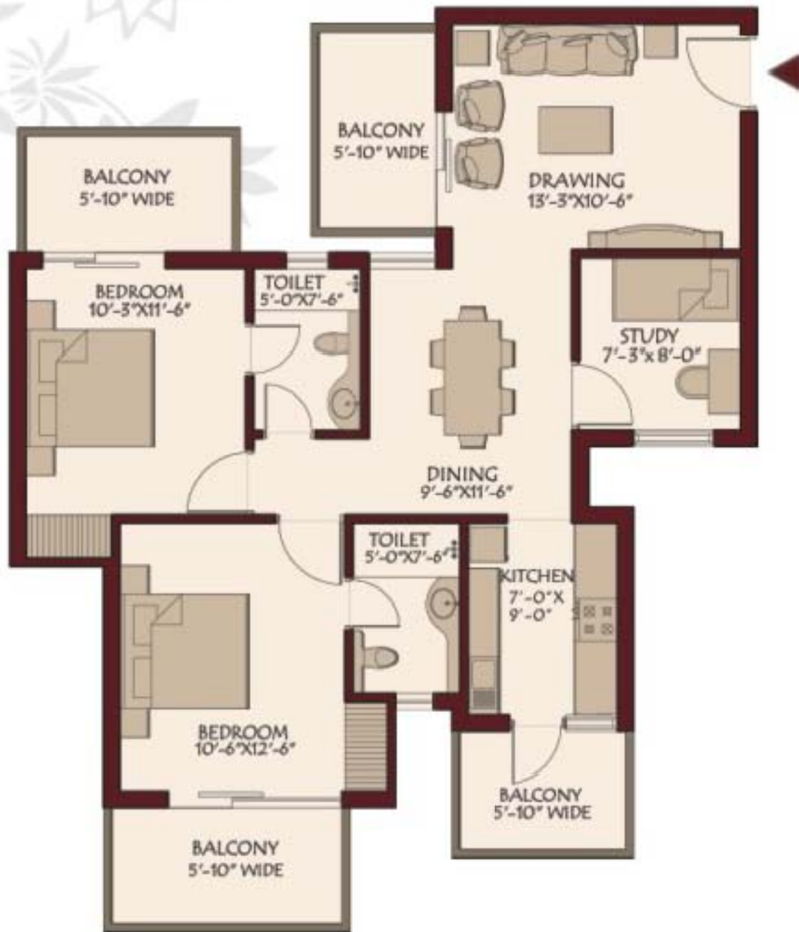
TWO BED ROOM UNIT PLAN WITH STUDY ROOM SUPER AREA = 1279 sq.ft.