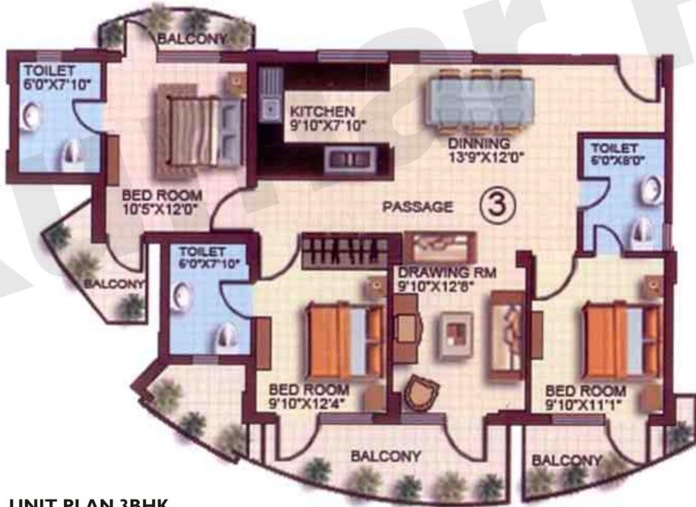
UNIT PLAN 3BHK 1535 SQ.FT.