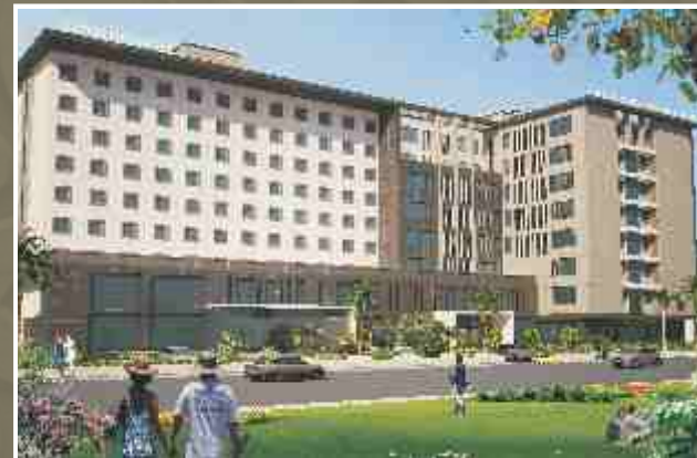
Optus Homotel & Corporate Suites, Bhiwadi