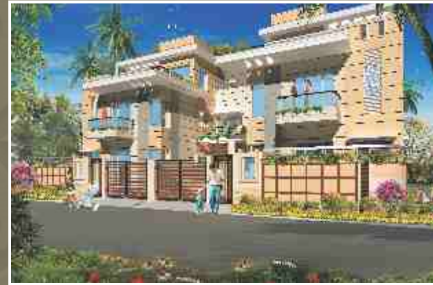
Optus Boutique Villas, Gurgaon