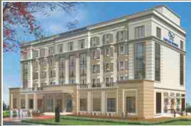
Optus Sarovar Premiere, Sec. 29, Gurgaon