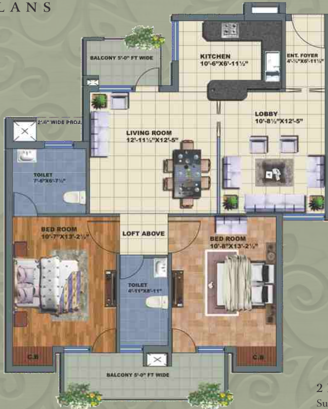
2 Bedroom Apartment Super Area : 1386.53 sq. ft.