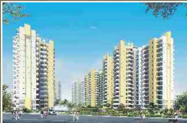
Corona Optus, 37C, Gurgaon