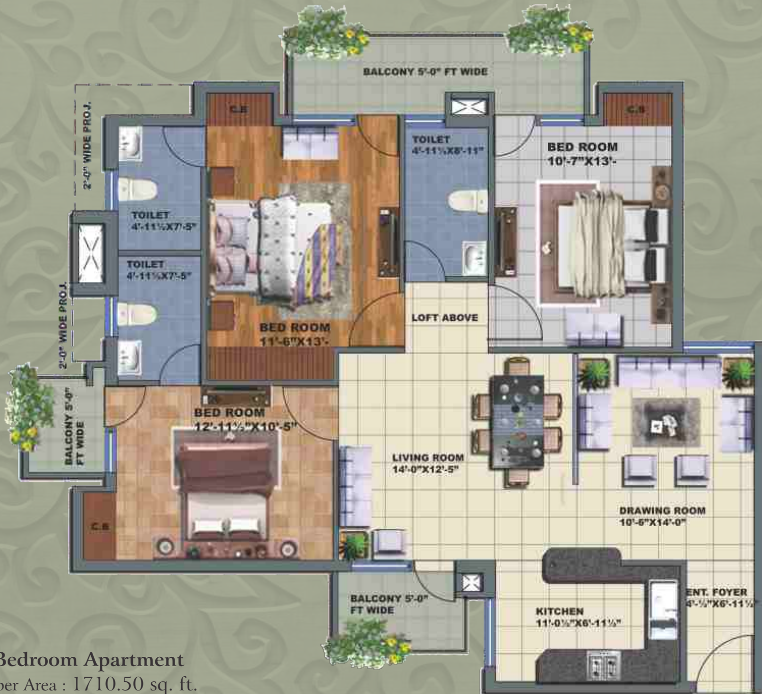
3 Bedroom Apartment Super Area : 1710.50 sq. ft.