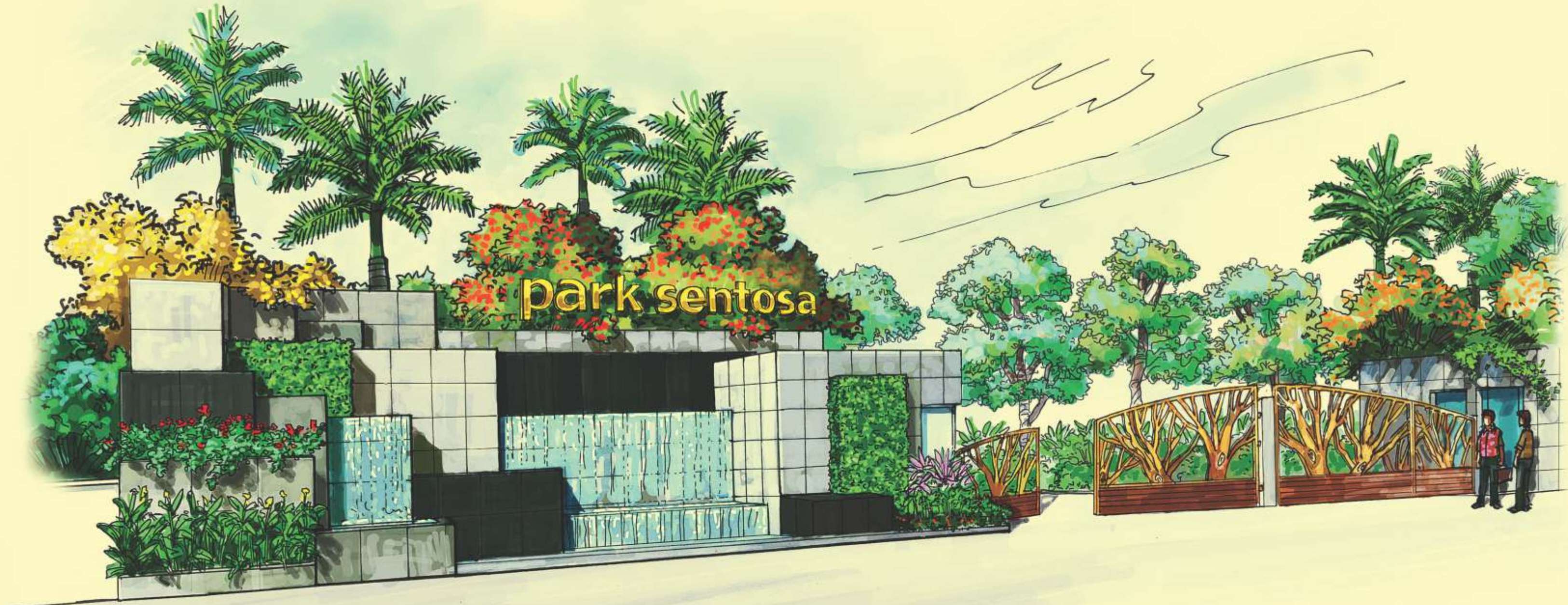
PARK SENTOSA ENTRANCE