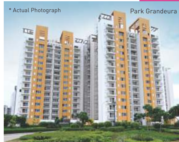
* Actual Photograph