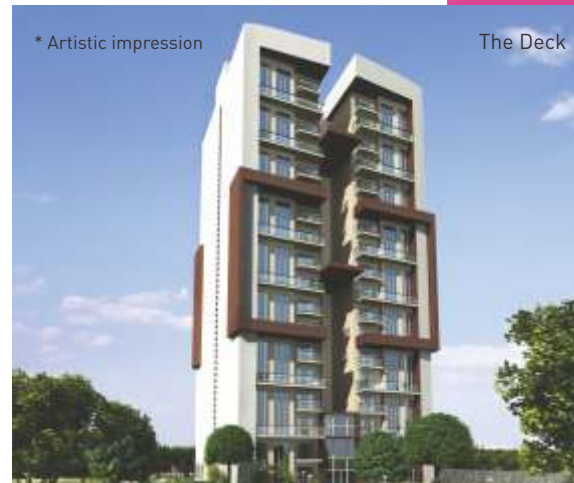
* Artistic impression